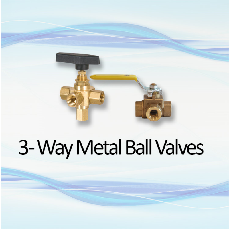
3- Way Metal Ball Valves